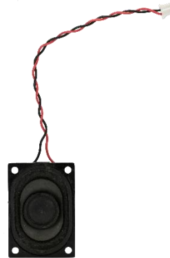
Speaker (x 1)