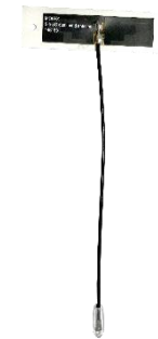
Wi-Fi/BT Antenna (x 2)