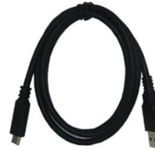
USB 3.0 Cable A to C