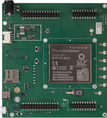
T62G-EA DK Board (With T62G-EA SOM)