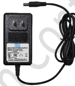
Power Adapter (except Japan) (1)